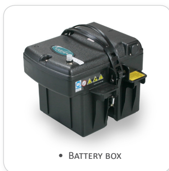
• BATTERY BOX