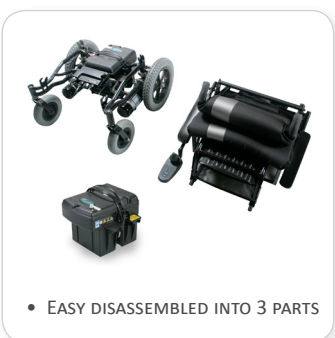
• EASY DISASSEMBLED INTO 3 PARTS